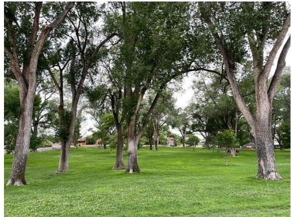
Hayder Park.