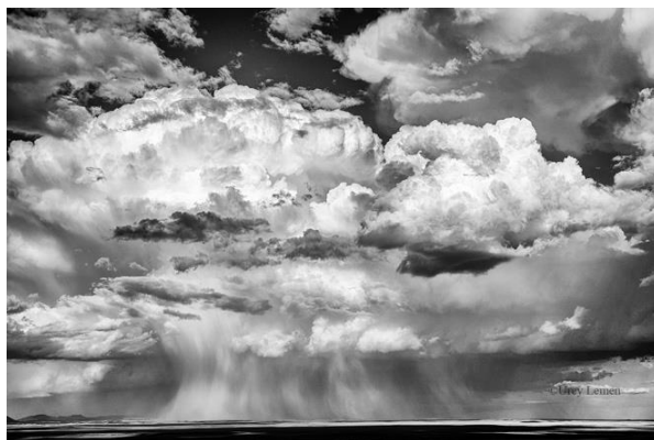
Here Come the Rain