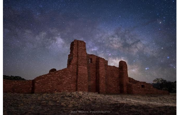
Abo Milky Way

Visit the gallery at 328 San Felipe St NW, Suite B, Albuquerque NM 87104. Hours are Monday-Saturday 11am-5pm and Sunday noon-5pm. Closed Tuesdays. And check out their website: www.abqphotographersgallery.com