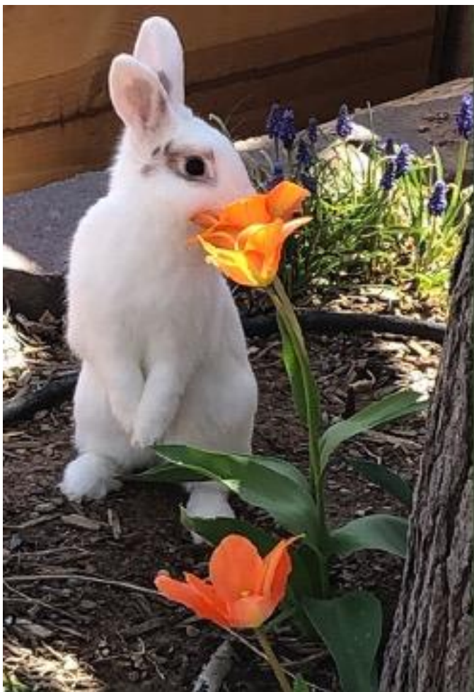
Winning photo by Josie Rielage