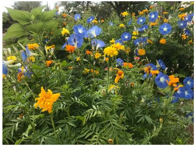
Winning photo by Bill Lagattuta

Albuquerque Photographers Gallery is located at 328 San Felipe NW in Old Town, just a few steps from great restaurants!