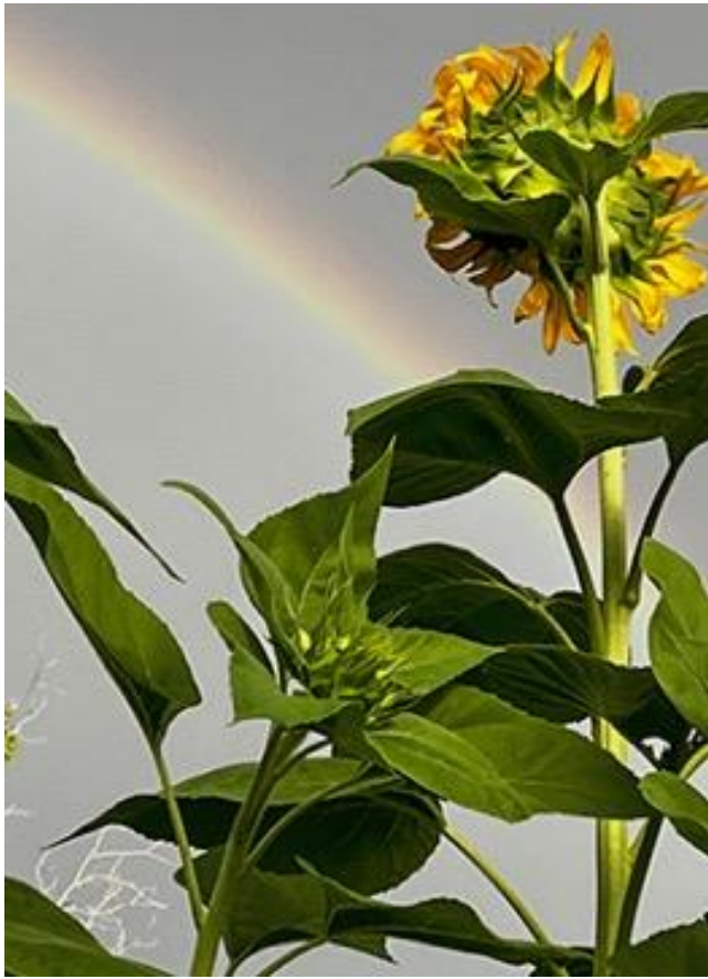
Winning photo by Ellen Fogg Kersh

If you wish to help with the organizational aspects of the Village, we could use your help.