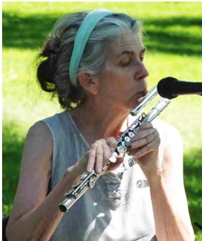
Saoirse flutist plays for the Launch Event

Though we were plagued by sound system problems at first, friends and neighbors were able to pull it all together for a two-hour plus gathering of fun, friendship, music, and enlightenment. Best of all, we were able to reconnect with old friends and meet so many new neighbors. The feeling of supportive community was palpable.