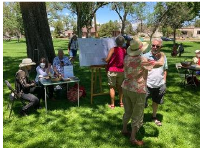
Launch Event in Hyder Park