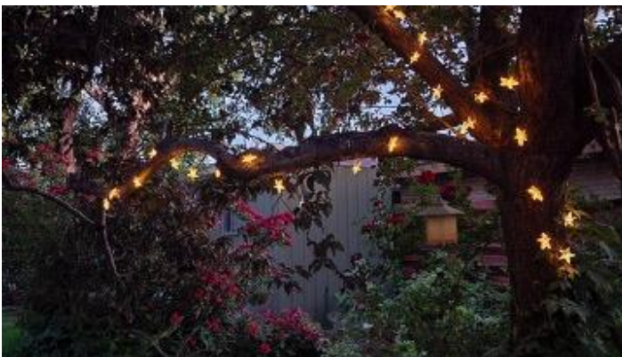
Winning

The conference was excellent, and we all learned a lot. There were workshops on fundraising, volunteer recruitment, strategic planning, and strategic partnerships. There were presentations on creative aging and on technology. The presentation on technology was given by a non-profit organization, Dorot, which provides training for “tech coaches.” This presentation was particularly exciting, because Dorot could provide support to our volunteers who are offering tech assistance as a service.