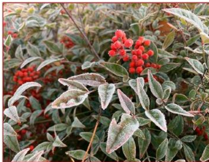
The First-Place winning photo by Marj Patrick is also our holiday card